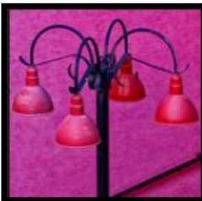
TITLE: Red Lights Against Pink Wall