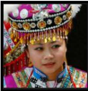
TITLE: Chinese Girl in Pink Traditional Costume