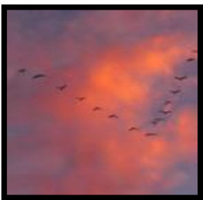
TITLE: A V of Geese Flying North at Dawn