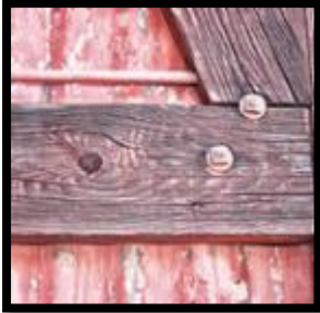
TITLE: Pink Board Design

Member submitted non-competition images with subjects that have the color pink.