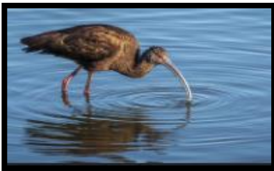
AA Jim Gain – White-faced Ibis Creates Ripples