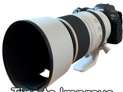
Tips to Improve Your Photography

Pay attention to the frame edges The image is more than the subject (usually). Scrutinize the corners and the sides and top and bottom of your frame. Is everything working together well, or is something completely out of place? Can you adjust to remove the “noise” of a busy scene? Look at the whole so the whole does not detract from your subject.