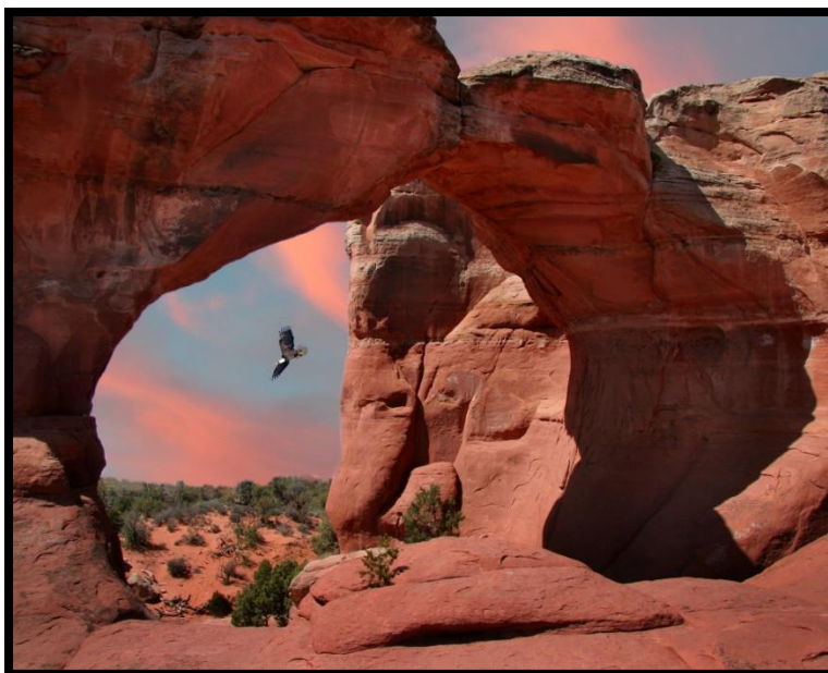
Image taken at Arches National Park and I added the clouds and the bird, like I always do...LOL !!!!