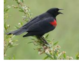
Red-winged Blackbird Singing by Janet Theilen