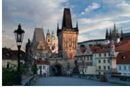
St. Charles Bridge Looking West