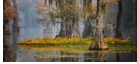
Wild Flowers Cado Lake by Gary Hunter