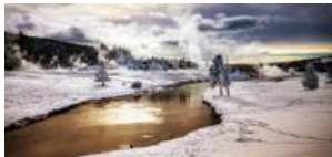
Winter in Yellowstone