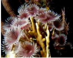
Featherduster Worm at 70 Feet in the Wild by Jack Hall