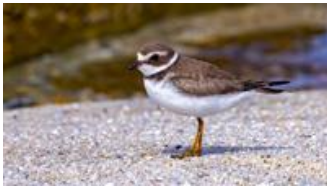
Placid Plover by Jim Gain