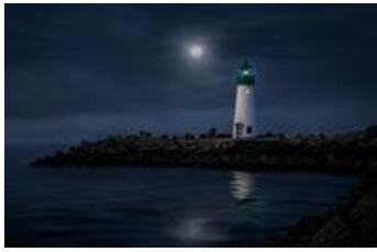
Blue Hour Moonset by Paula Shroyer