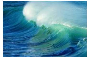
Cresting Wave at the Mouth of Big River Mendocino by Janet Theilen