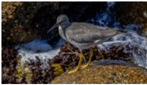
Wandering Tattler Forages in Surging Surf at Pacific Grove Shoreline