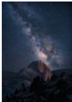
Milky Way Over Half Dome