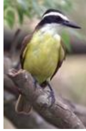
A Great Kiskadee Perched Over Water Looking for a Fish Lunch by Rich Brown