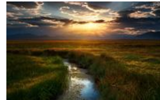
Sunset in the Owens Valley