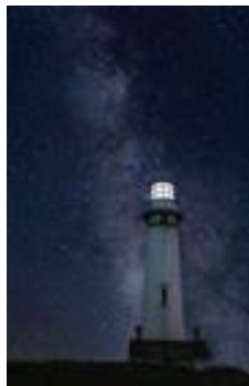
Milky Way Looms Behind Pigeon Point Lighthouse