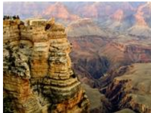
Grand Canyon South Rim Mather Point Overlook at Dusk