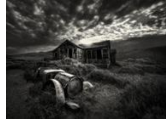
Abandoned in Bodie