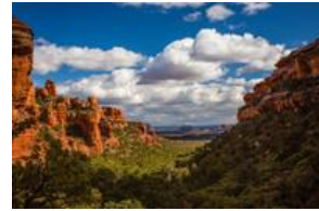
Late Afternoon Sedona Arizona