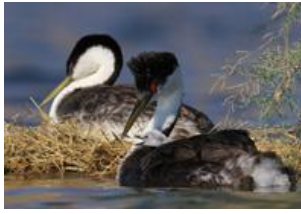
Grebe Feeding Fish to Young